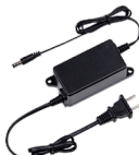
PFM320 12V 2A Power Adapter