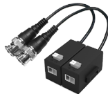
PFM800-E Passive HDCVI Balun